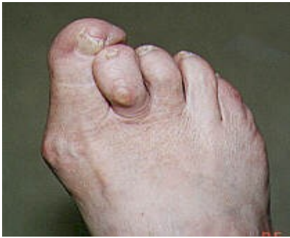
Hammer Toe with corn developing

A Hammer Toe is a toe that is contracted at the proximal inter-phalangeal joint (middle joint in the toe) – it can lead to severe pressure points from footwear, pain and calluses.